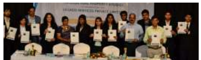
OFFICIAL LAUNCH OF SOLink ON WORLD IP DAY

All in all, the Fest couldn't be any more grand or successful or any more engaging. Everyone, thoroughly enjoyed participating and even being the audience. The Fest is awaited yet again in the next year more than anything.