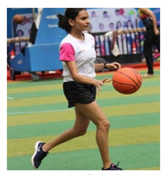
Sports Squad (Parakram)