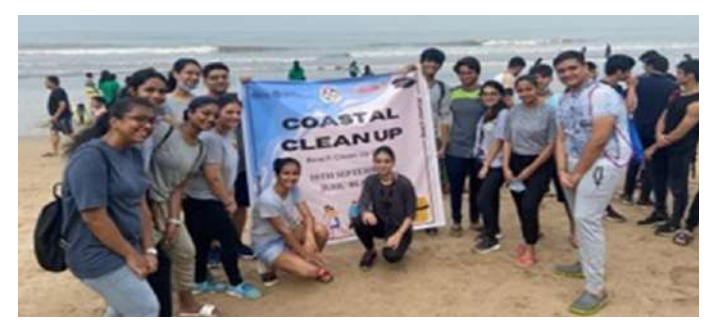
Sports Squad (Beach Clean-up Drive)