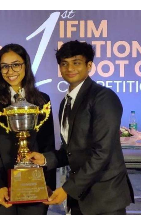
IFIM National Moot Court Winner 2021-22