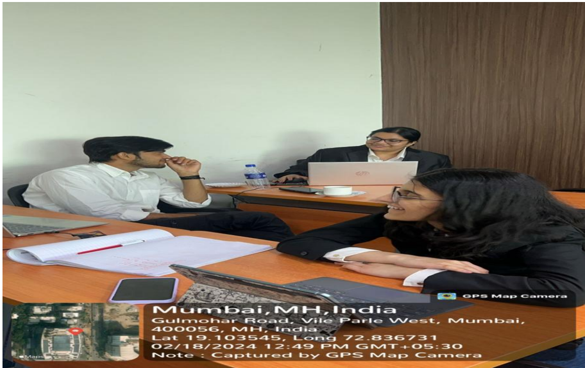
GLIMPSE OF OUR TEAM WORKING