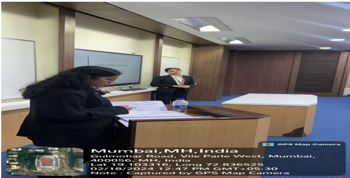
OUR PANELISTS PRESENTING THEIR PAPERS

The International Conference on 17th and 18th February 2024 aimed to provide a comprehensive understanding of global issues through panel discussions featuring judges, advocates, and law firms. It aimed to foster a dynamic exchange of ideas among participants with diverse experience and expertise, promoting a richer understanding of the legal frameworks needed to address global complexities.