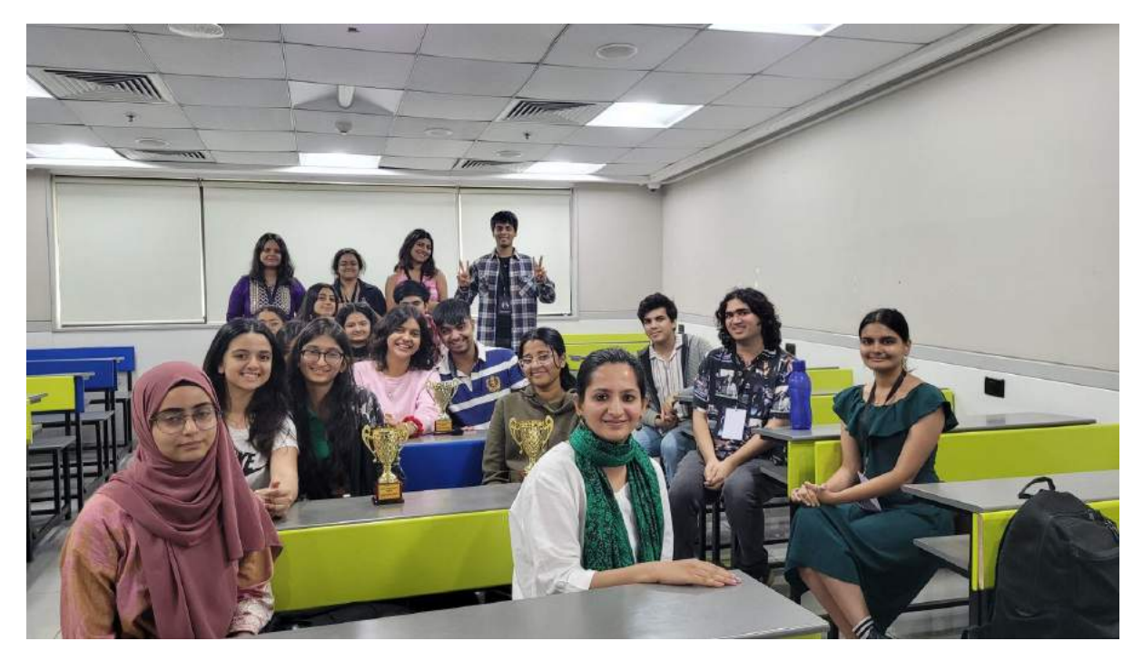
Finalists and Organizing Committee